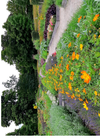
Display gardens open to the public below the Manor.