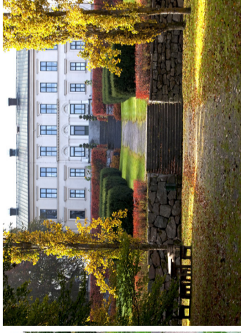
Around Karlslund's manor you find parks created in different time eras.