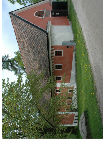
Start your visit in Ankarvärd's Warehouse where you can learn more about the culture reserve.